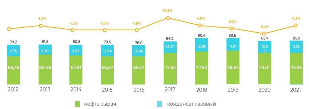
Figure 1: Oil and condensate production dynamics, million tons

Although there have been recent geopolitical challenges, oil production in Kazakhstan has seen a positive growth trend in 2021, with a total of 85.9 million tons produced (23% of which was consumed domestically), while gas production amounted to 54.2 billion cubic meters. Over the past 30 years, Kazakhstan has increased oil production 3.5 times, and in 2021 its rank was 13<sup>th</sup> by production, in the world (2% of global production) (Fig.1).