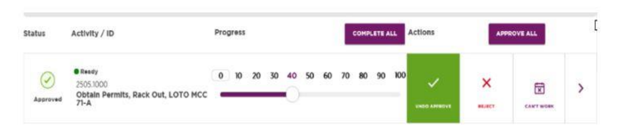
Figure 4: Illustration of entering a percentage of the work performed in TA Pro app.

Of course, the progress of critical work must be monitored very closely and only up-to-date information must be entered independently if there is field experience, or specialists must be involved. As a result, when approaching the peak hour, it was possible to only click on the data synchronization button and the program gave the user a recalculated graph with updated data for all equipment units.