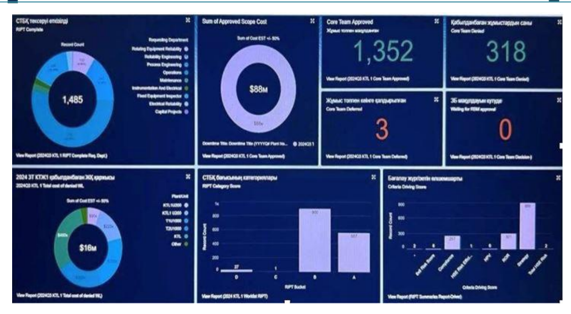
Figure 3: Salesforce app dashboard

One of the key features of the platform is a built-in prioritization tool based on integrity and reliability factors (RIPT). RIPT is a prioritization tool used to aggregate large amounts of inputs and help identify the most needed work and also offers a recommended sequence of execution to decision-makers. It